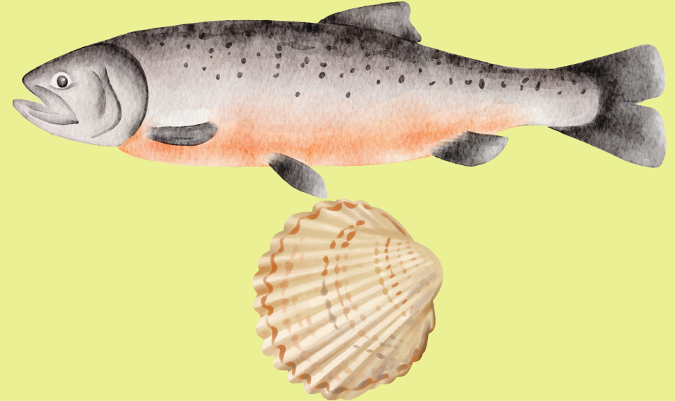
Fish & shellfish